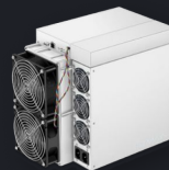
Bitman Antminer S19 Pro